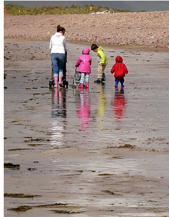
Family dressed for the weather for V6491